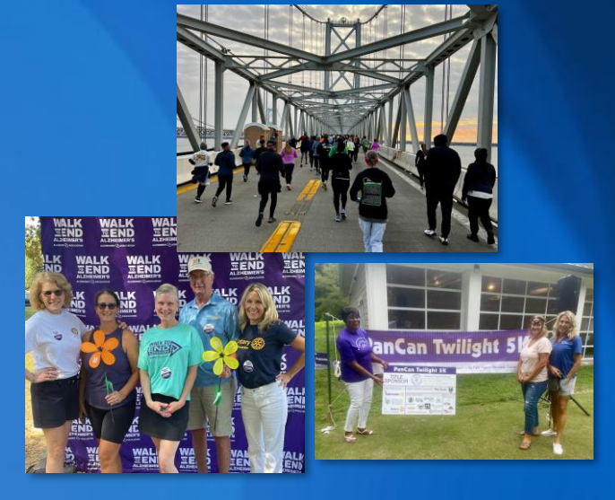
Charity Fun Runs