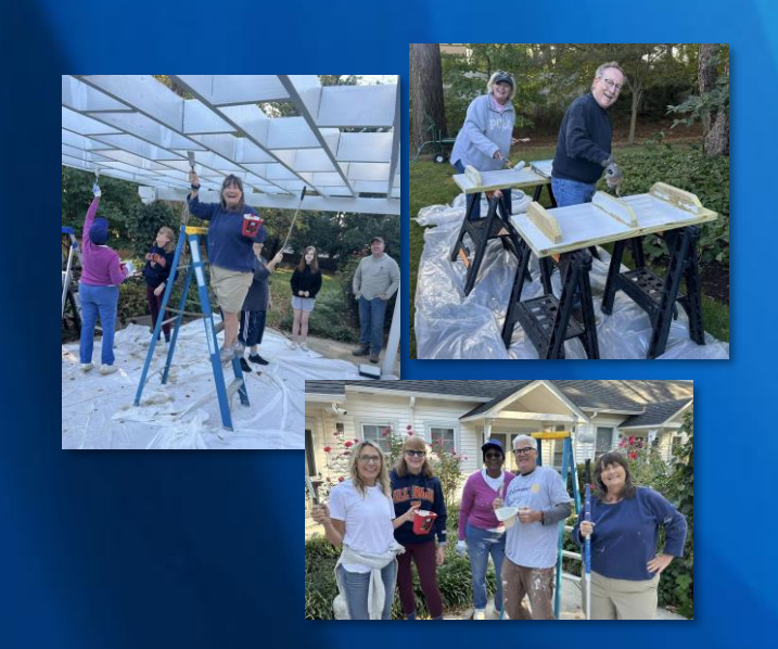
Hospice Backyard Cleanup