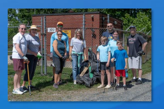
Rails to Trails Cleanup